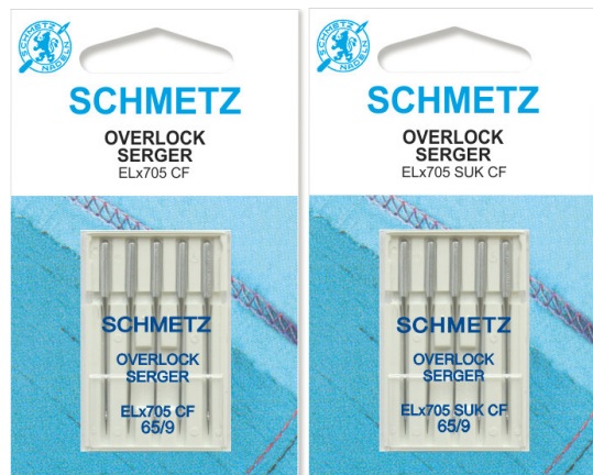
Needle packaging and seam example